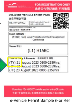
e-Vehicle Permit Sample (For Ref)